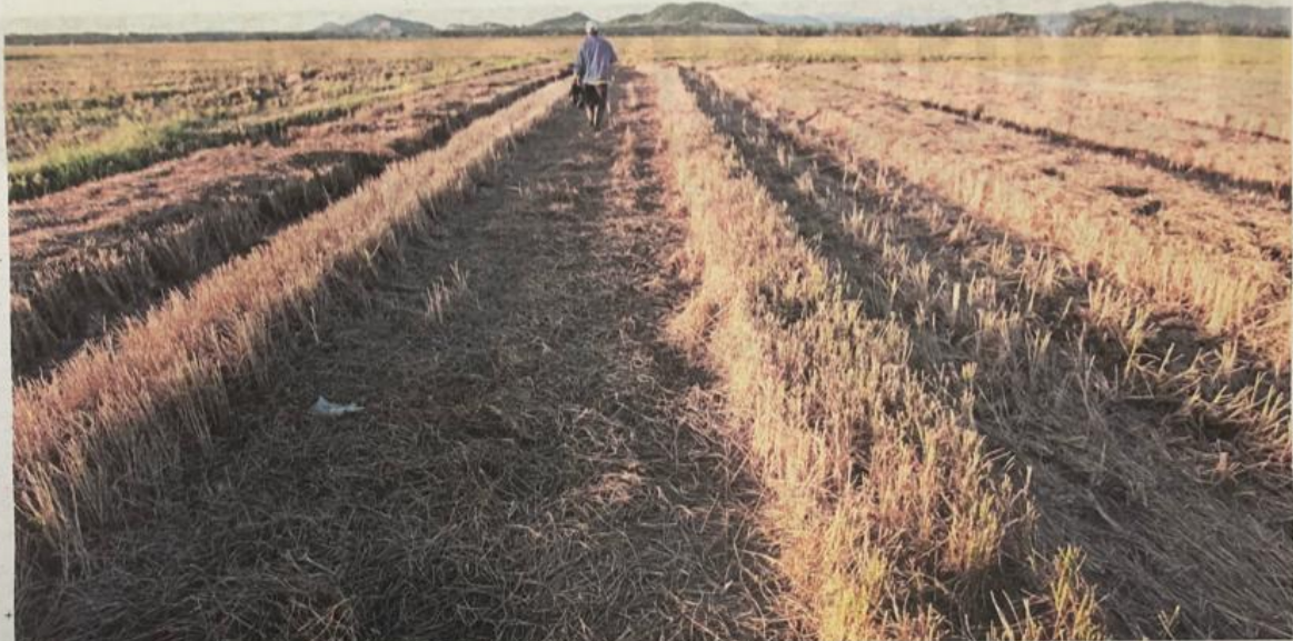
Rice stalks have withered due to hot weather at Kampung Tanjung Pisang in Alor Star.